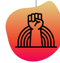
LGBT Resource Center