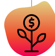
Financial Wellness Center