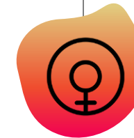
Women's Resource Center