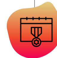
Veterans Support Center