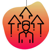
Career Professional Development

We provide services to help eliminate impediments, generate options, facilitate growth, give back to the community and enable the student to fully function in pursuit of their degree and planning of their future.