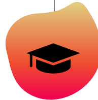
ELP – SA Partnership